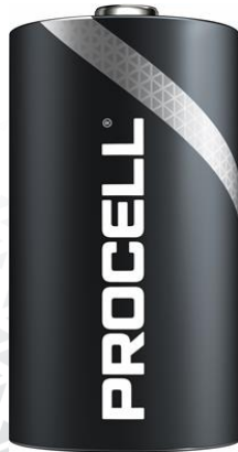
Size: D (LR20) PC1300